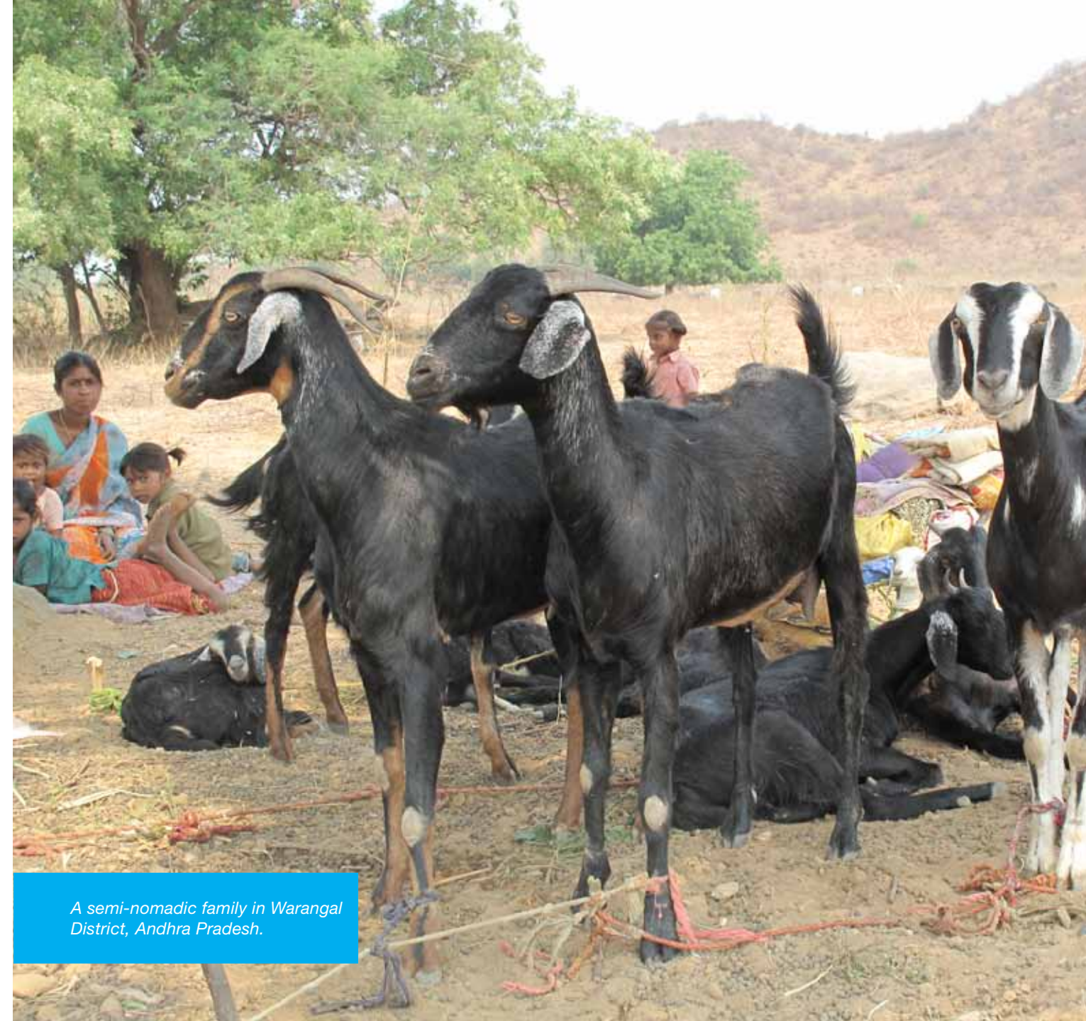
A semi-nomadic family in Warangal District, Andhra Pradesh.