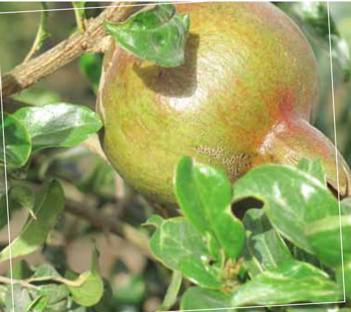
▲ During the first year of the project, farmers in the Rajasthan pilot site planted 6000 fruit trees. Pomegranate is one of the more popular species.

Besides engendering a duty of care, this ethos will ensure the sustainability of both the livelihoods programme and the carbon project. Farmers' contributions to the livelihoods programme amounted to 19.8 million rupees (US$440,000) by mid-2011. The figure for the carbon project is much smaller, partly because it is of more recent origin and partly because it reaches fewer people. By March 2011, farmers at the Rajasthan pilot site had contributed 60,000 rupees (US$1300) towards the total cost of saplings, chulahs and CFL bulbs, which amounted to 200,000 rupees (US$4500). As in Andhra Pradesh, these funds are held by an organisation representing local communities. They will be used to pay the salaries of individuals who manage the grid's carbon finance and support carbon-related activities once the project officially comes to an end.