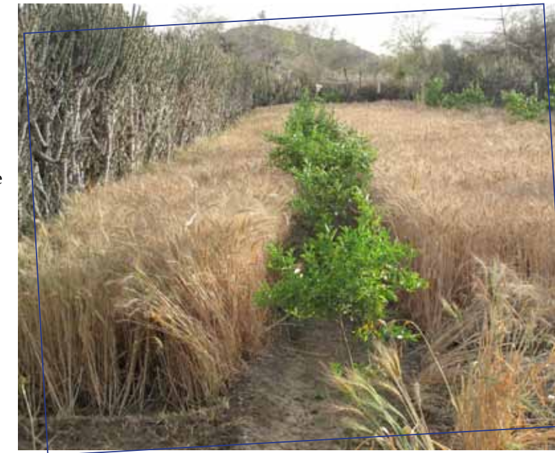
▲ A temporary state of affairs: a cereal field in Rajasthan in the process of being converted to a citrus orchard.