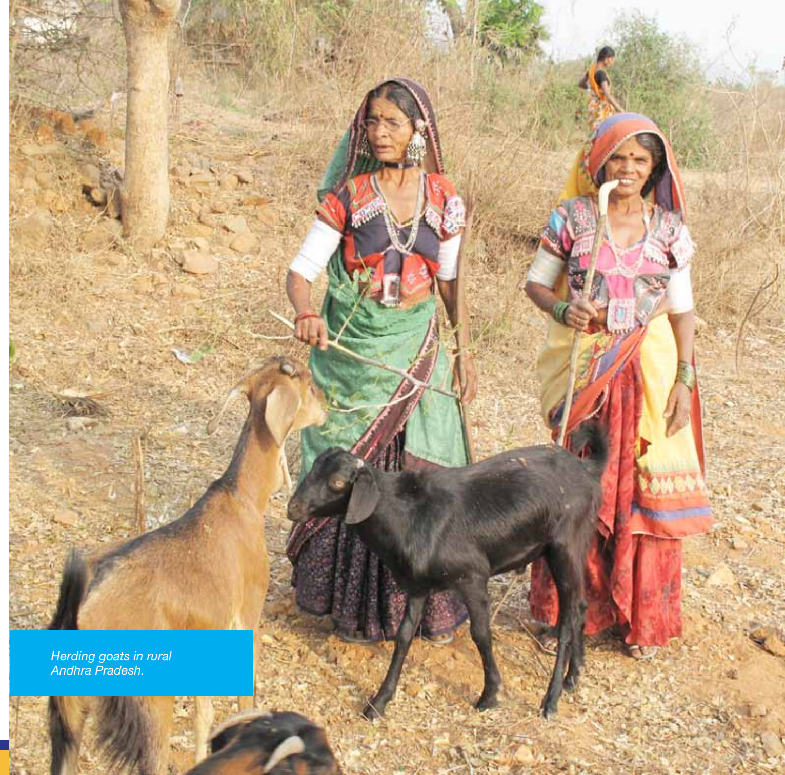
Herding goats in rural Andhra Pradesh.