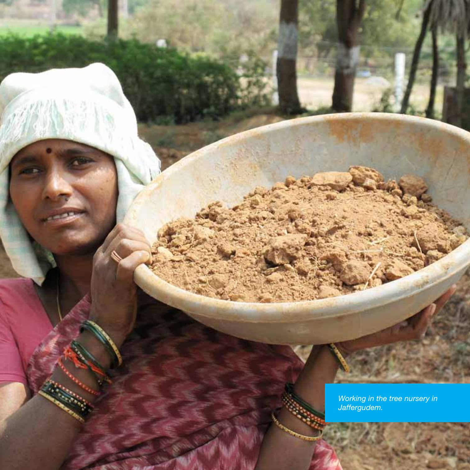
Working in the tree nursery in Jaffergudem.