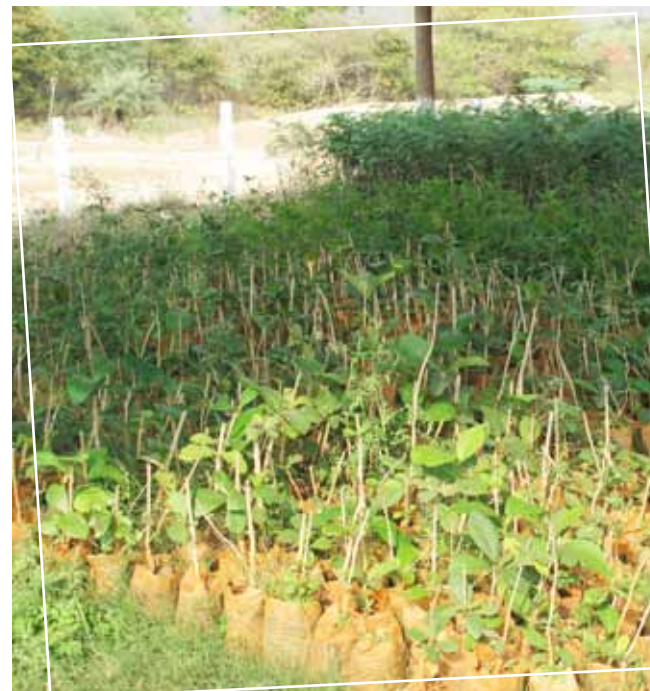
▲ A tree nursery established under the carbon project.