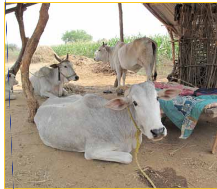
▲ Many of the small-scale farmers who are benefiting from the carbon project depend on both livestock and crops to make a living.