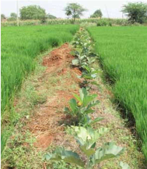
▲ Farmers are contributing towards the cost of the teak seedlings which they are planting around their fields.