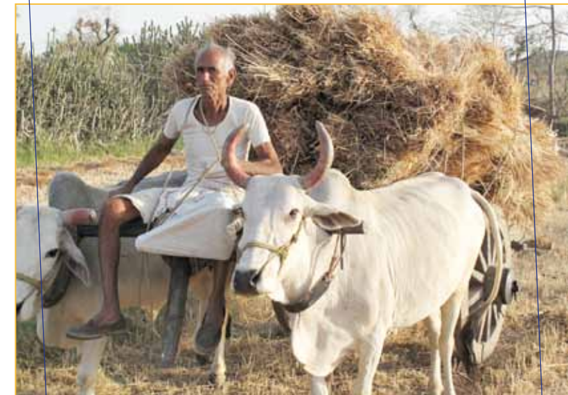
▲ India's 280 million cows are a significant source of methane, as well as milk, hides and draught power.

In 2007, the average Indian citizen was responsible for 1.43 tonnes of carbon dioxide (CO 2 ) emissions – small beer compared to the 19.34 and 9.57 tonnes emitted by the average American and German. But this only tells part of the story. India's greenhouse gas emissions rose by almost 60% between 1994 and 2007, and its per capita CO 2 emissions are expected to triple by