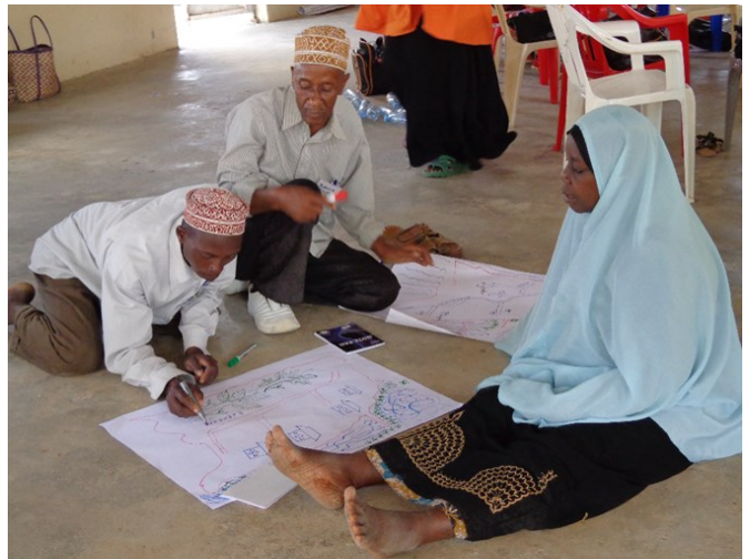
A Participatory workshop process