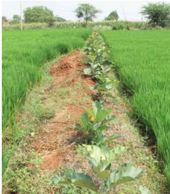
▲ Farmers are contributing towards the cost of the teak seedlings which they are planting around their fields.